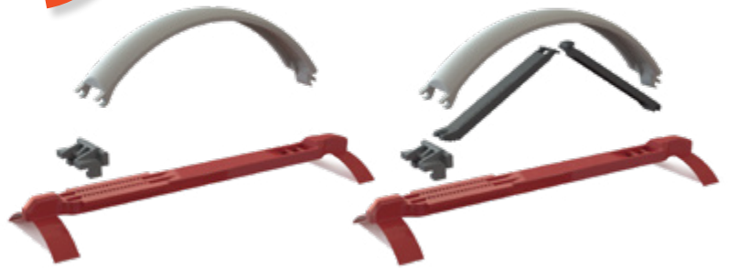
RITELINE CASING SPACERS: